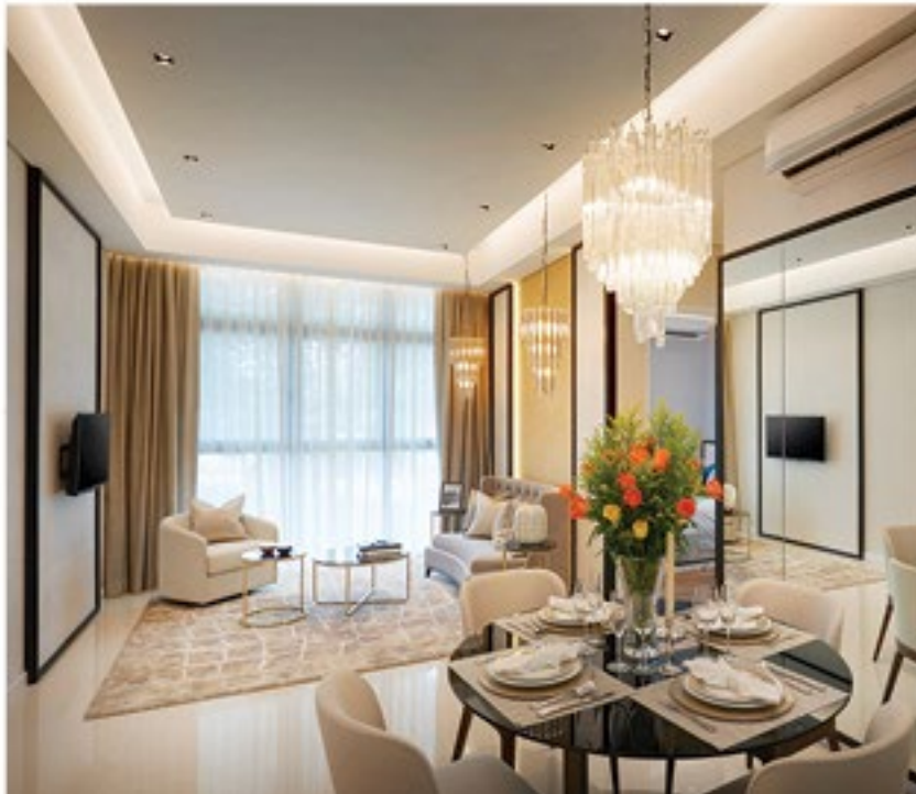
Waltz Residences, WCity OUG, Kuala Lumpur, Malaysia Waltz Residences, WCity OUG, 吉隆坡, 马来西亚