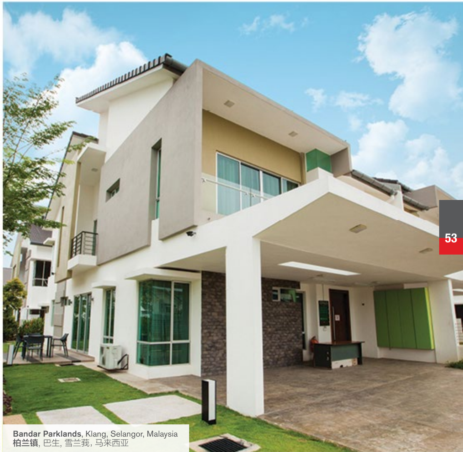
Bandar Parklands, Klang, Selangor, Malaysia 柏兰镇, 巴生, 雪兰莪, 马来西亚

武吉丁宜综合城镇是 WCT 在巴生南部的旗舰房地产项目。武吉丁宜镇总面积达1千340英亩，由三大区域组成，即武吉丁宜第一区、第二区及柏兰镇。WCT 成功将武吉丁宜镇打造成为自给自足的城镇，因为整个武吉丁宜镇包含住宅发展、商业枢纽、卓越的交通枢纽与衔接路线、全方位公共设施和完善设备，例如巴生鼎峰酒店、BBT ONE The Towers 办公大楼、武吉丁宜购物中心、学校及霸级市场（特易购和巨人霸级市场）。屹立在策略地点的武吉丁宜镇，凭借种种优势，成功转型至充满活力、家喻户晓的城镇，如今是大约9万名居民的家园。