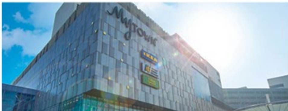
MyTOWN Shopping Centre, Jalan Cochrane, Kuala Lumpur, Malaysia MyTOWN 购物中心, 葛京路, 吉隆坡, 马来西亚