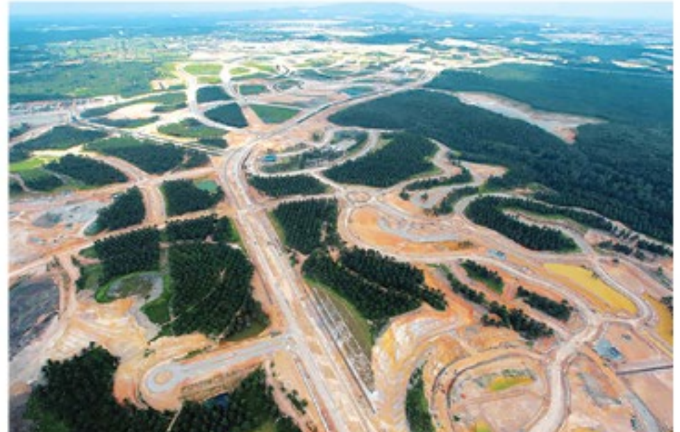
Medini, Bandar Medini Iskandar, Iskandar Puteri, Johor, Malaysia 美迪尼, 依斯干达美迪尼城, 依斯干达公主城, 柔佛, 马来西亚