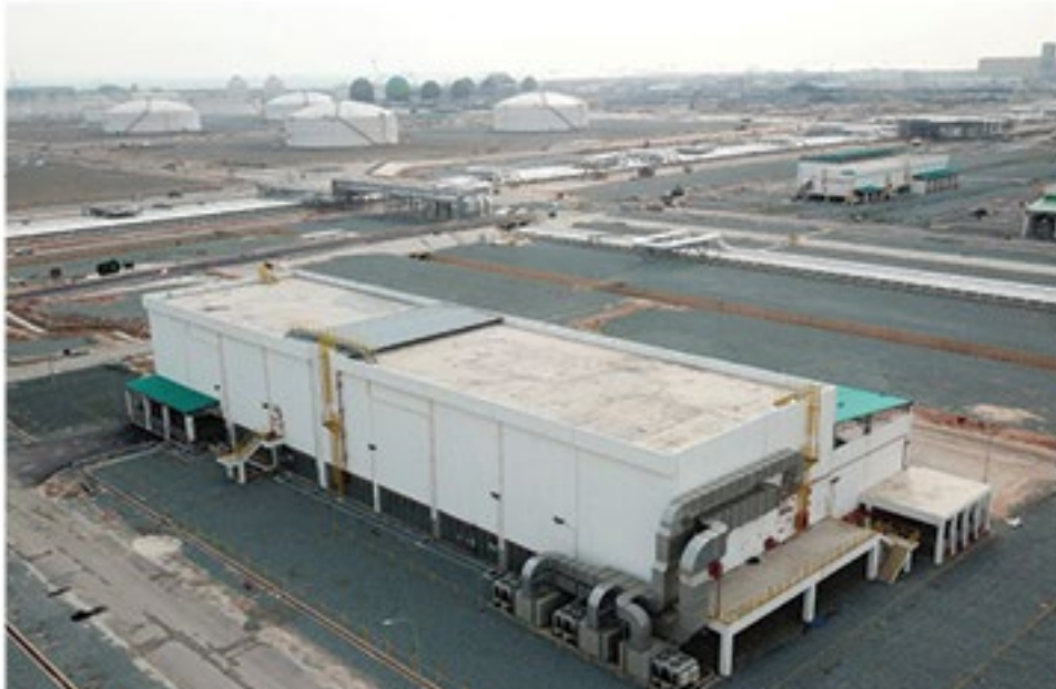
Petronas RAPID Pengerang Site, Johor, Malaysia 边佳兰马来西亚国油炼油及石油化学综合发展计划, 柔佛, 马来西亚