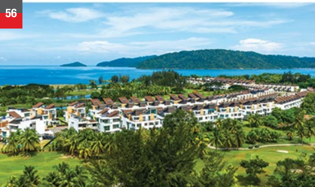
d'Banyan Residency @ Sutera Harbour, Kota Kinabalu, Sabah, Malaysia d'Banyan Residency @ Sutera Harbour, 亚庇, 沙巴, 马来西亚

WCT's successful venture into the development of exclusive residences has resulted in d'Laman Greenville in Klang, Selangor and d'Banyan Residency @ Sutera Harbour in Kota Kinabalu, Sabah.