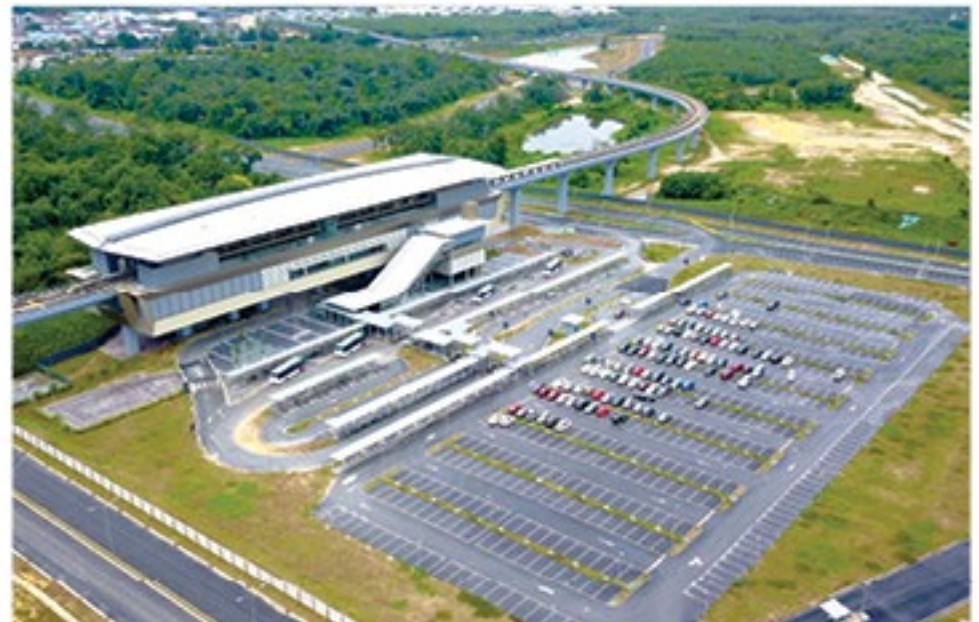
Kwasa Damansara Township Development, Sungai Buloh, Selangor, Malaysia 桂莎白沙罗镇区发展, 双溪毛糯, 雪兰莪, 马来西亚