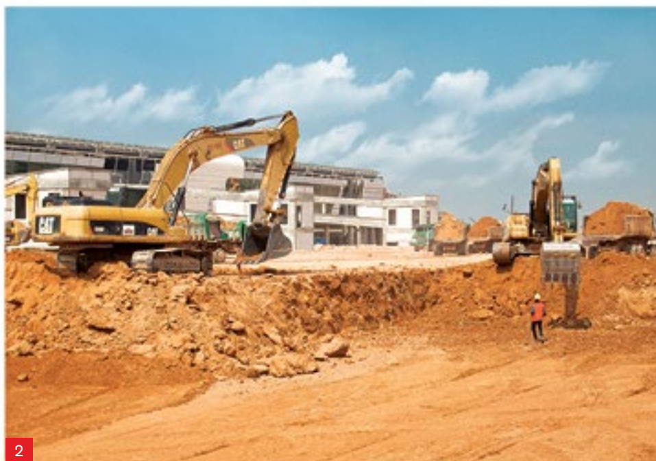
4 Hamad International Airport (formerly known as New Doha International Airport), Qatar 哈马德国际机场 (原名为新多 哈国际机场), 卡塔尔