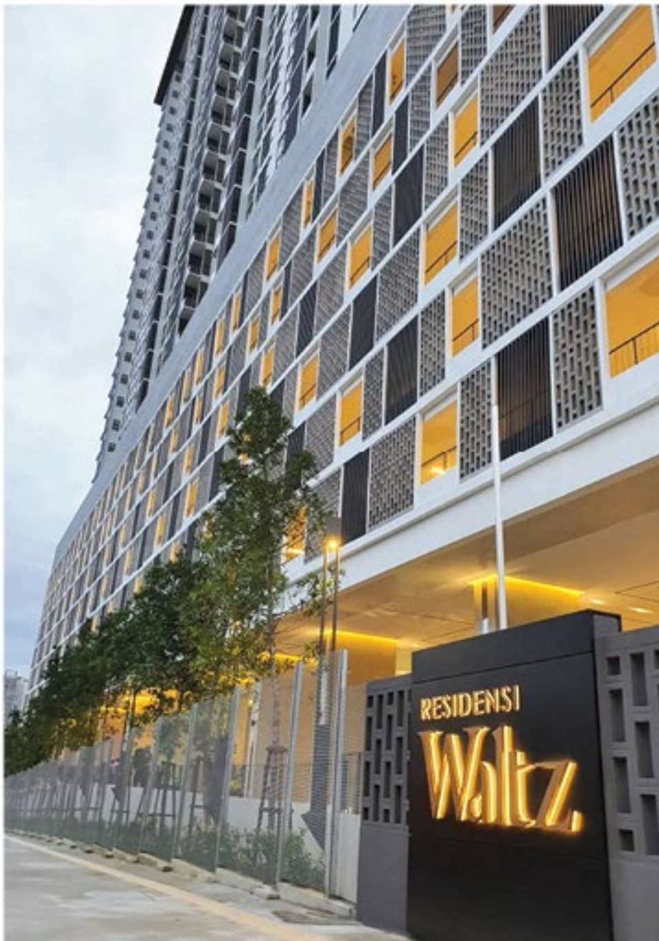
Waltz Residences , Kuala Lumpur, Malaysia Waltz Residences , 吉隆坡, 马来西亚