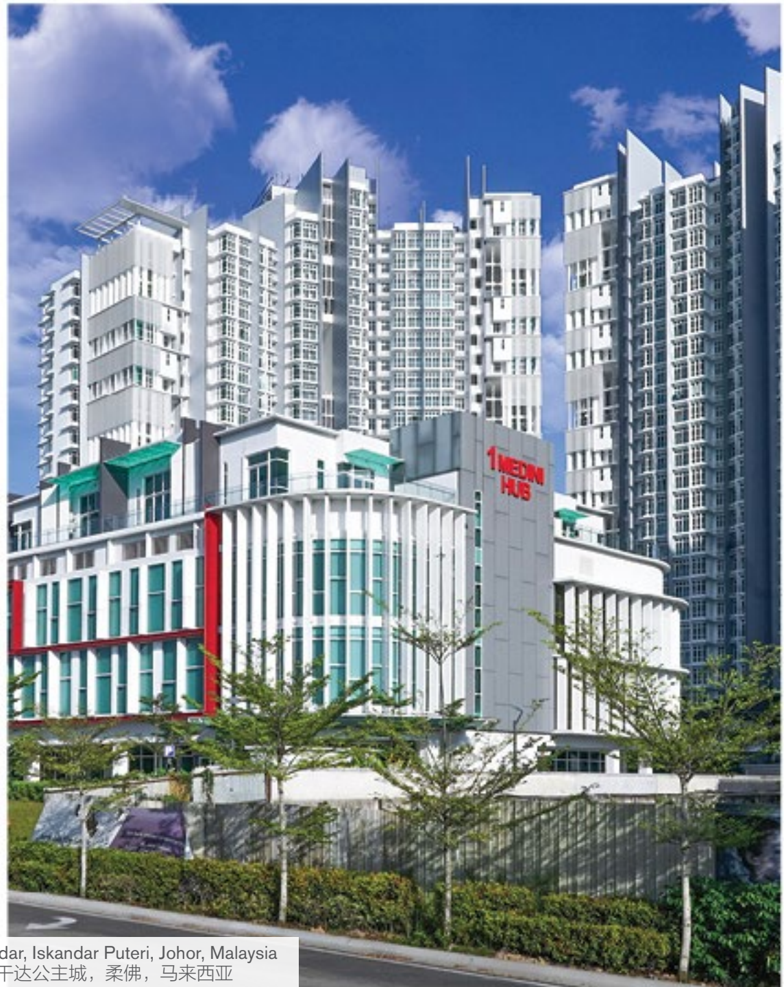
1Medini and Medini Signature Development , Bandar Medini Iskandar, Iskandar Puteri, Johor, Malaysia 1Medini 及 Medini Signature 发展计划 , 依斯干达美迪尼城, 依斯干达公主城, 柔佛, 马来西亚