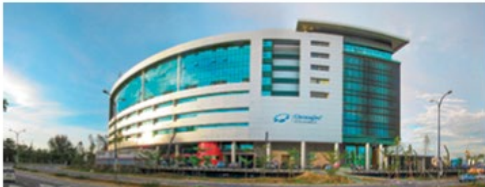
Kota Kinabalu Medical Centre, Sabah, Malaysia 亚庇医药中心, 沙巴, 马来西亚