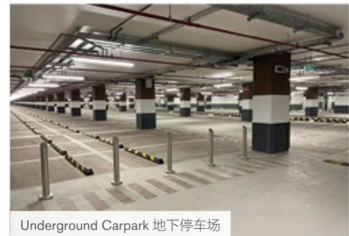
Underground Carpark 地下停车场