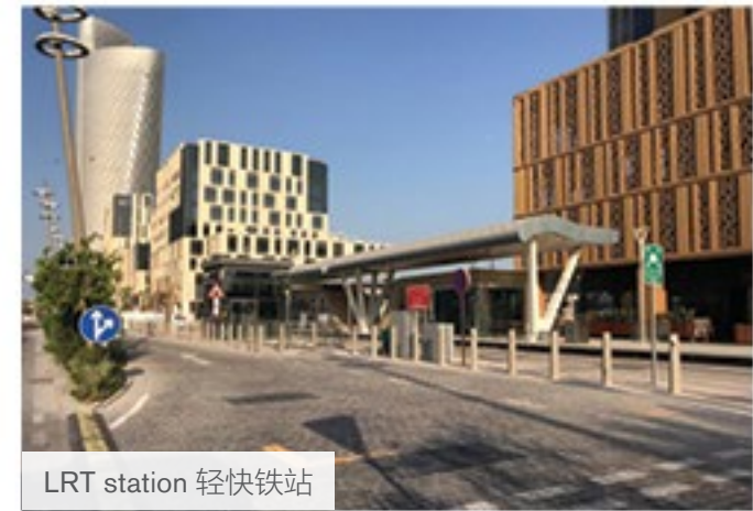
LRT station 轻快铁站

这项耗资13亿令吉的项目 (WCT与Al-Ali Projects Co (W.L.L.) 按70:30合资比例进行) 涵盖商业大道、主要道路与内部通道、公共设施、4座轻快铁车站和4座两层楼地下停车场。卢赛尔开发项目位于卢赛尔城, 整体发展面积为38平方公里, 涵盖住宅、娱乐和商业特区, 以及一座用于2022年FIFA世界杯的世界级足球场。