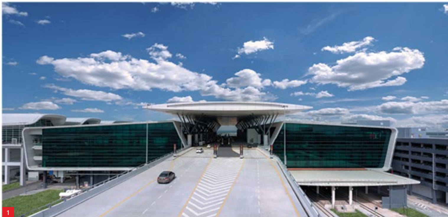
1 gateway@klia2 (Airport Mall), Sepang, Selangor, Malaysia gateway@klia2 (机场购物商 场), 雪邦, 雪兰莪, 马来西亚