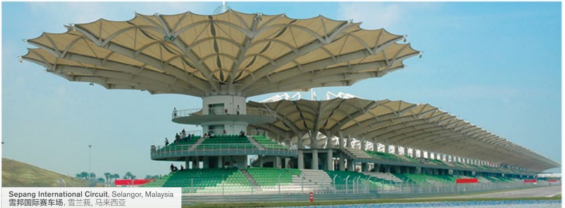
Sepang International Circuit, Selangor, Malaysia 雪邦国际赛车场, 雪兰莪, 马来西亚