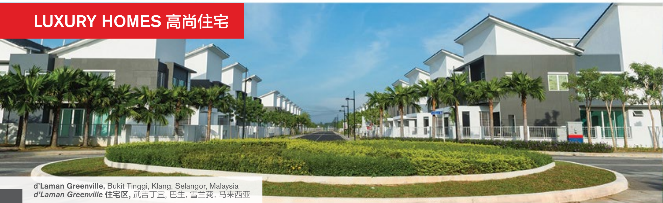
d'Laman Greenville, Bukit Tinggi, Klang, Selangor, Malaysia d'Laman Greenville 住宅区, 武吉丁宜, 巴生, 雪兰莪, 马来西亚