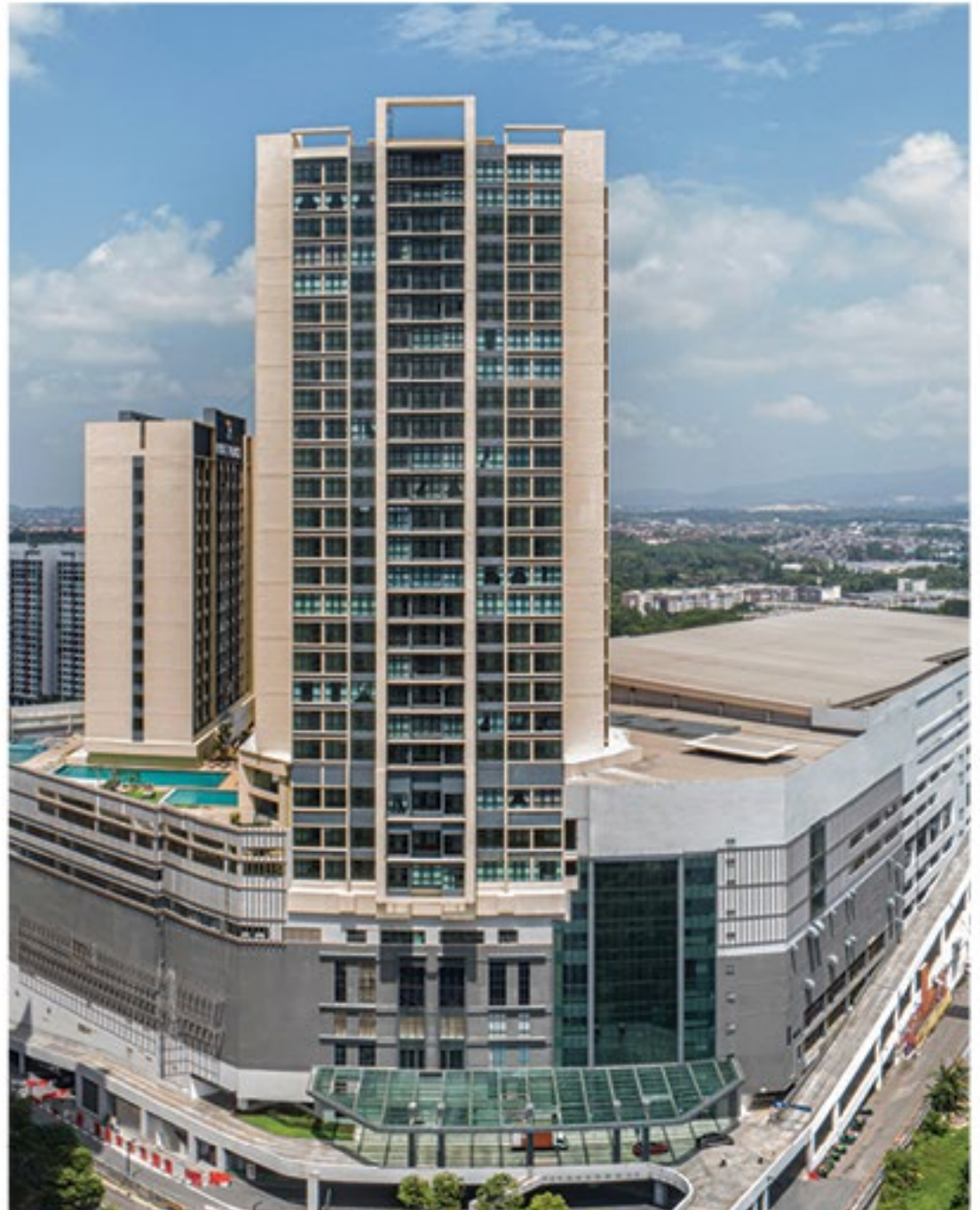
Paradigm Residence, Paradigm Johor Bahru, Johor, Malaysia Paradigm Residence, 新山佰乐泰, 柔佛, 马来西亚