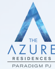
Paradigm Petaling Jaya, Selangor, Malaysia 八打灵再也佰乐泰, 雪兰莪, 马来西亚