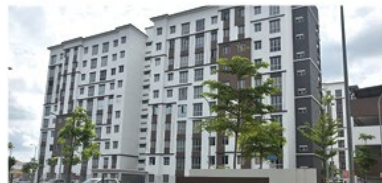
Azaria Apartments , Bandar Parklands, Klang, Selangor, Malaysia Azaria Apartments , 柏兰城, 巴生, 雪兰莪, 马来西亚