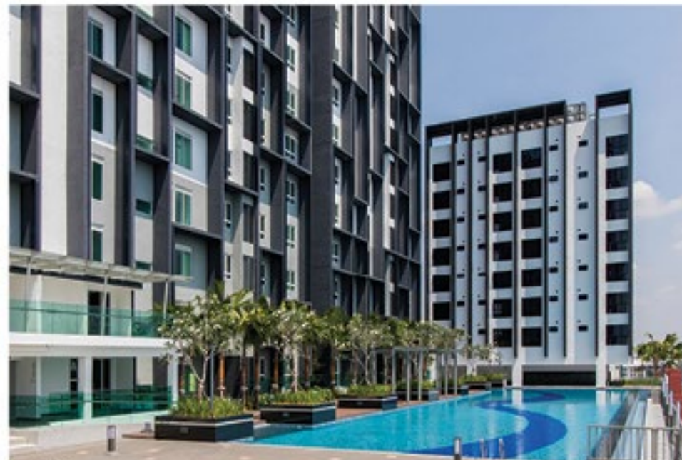
Impiria Residensi , Bandar Bukit Tinggi 2, Klang, Selangor, Malaysia Impiria Residensi , 武吉丁宜镇第二区, 巴生, 雪兰莪, 马来西亚