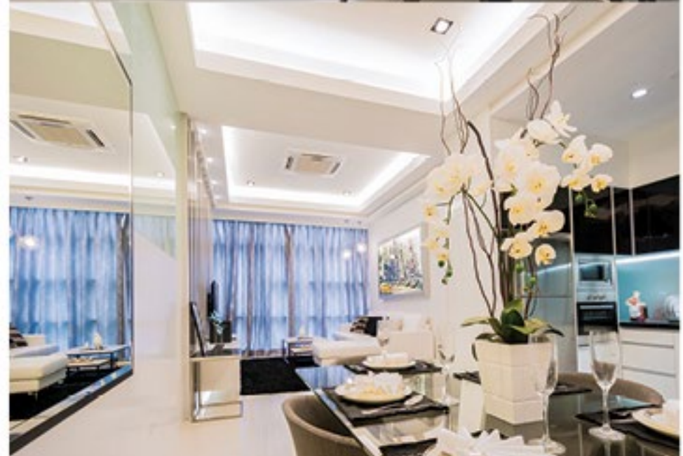
The Azure Residences , Paradigm Petaling Jaya, Selangor, Malaysia The Azure Residences , 八打灵再也伯乐泰, 雪兰莪, 马来西亚