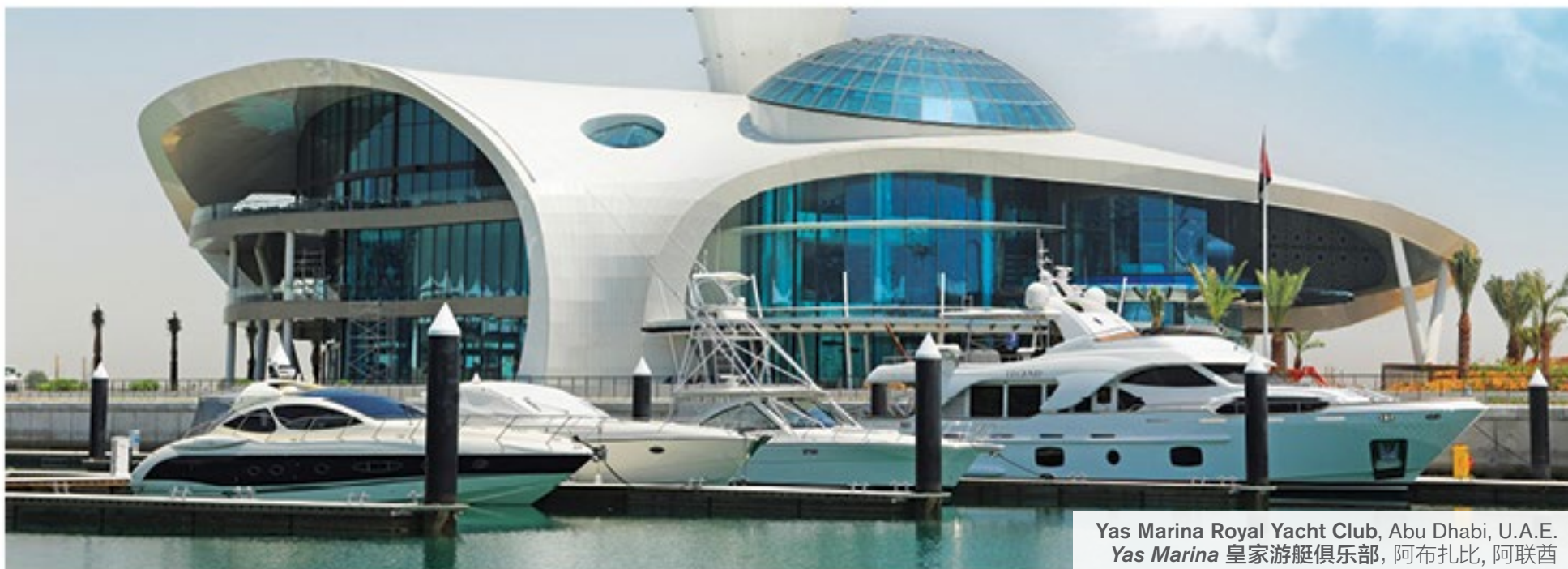
Yas Marina Royal Yacht Club, Abu Dhabi, U.A.E. Yas Marina 皇家游艇俱乐部, 阿布扎比, 阿联酋

这项建筑工程合约高达16亿令吉打造的项目是在2008年9月完成，所涉及的工程范围包括在巴林建立最大型购物广场、多层停车场、酒店、主题乐园、水上乐园及20间电影院。