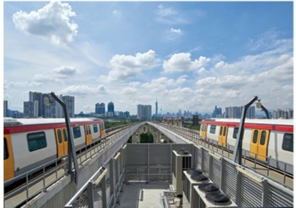
MRT2 (V204 & S204) Bandar Malaysia South Portal to Kampung Muhibbah, Malaysia 捷运第二路线 (V204 及 S204) 马来西亚城南站至亲善村, 马来西亚

凭借卓越的建筑项目组合，该集团不仅完成了三个屡获殊荣的 F1 赛道，还在建设超过 500 公里的高速公路、主导五个机场项目，并在马来西亚、印度、卡塔尔和巴林推进多个可持续发展项目方面取得了卓越成就。