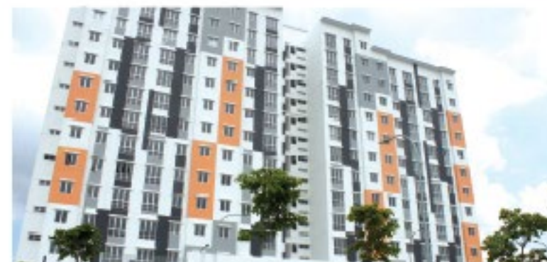
Aronia Apartments , Bandar Parklands, Klang, Selangor, Malaysia Aronia Apartments , 柏兰城, 巴生, 雪兰莪, 马来西亚