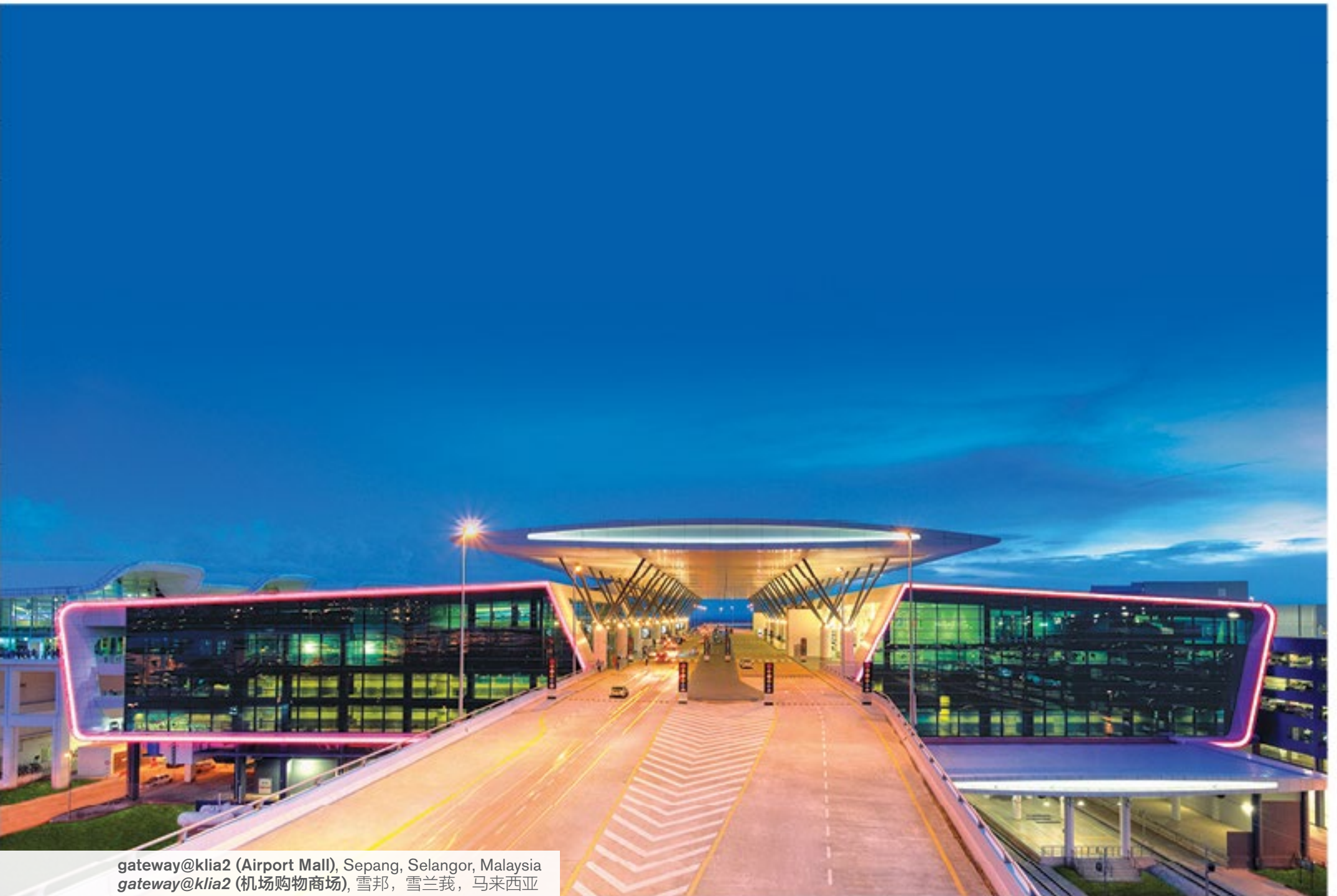
gateway@klia2 (Airport Mall), Sepang, Selangor, Malaysia gateway@klia2 (机场购物商场), 雪邦, 雪兰莪, 马来西亚