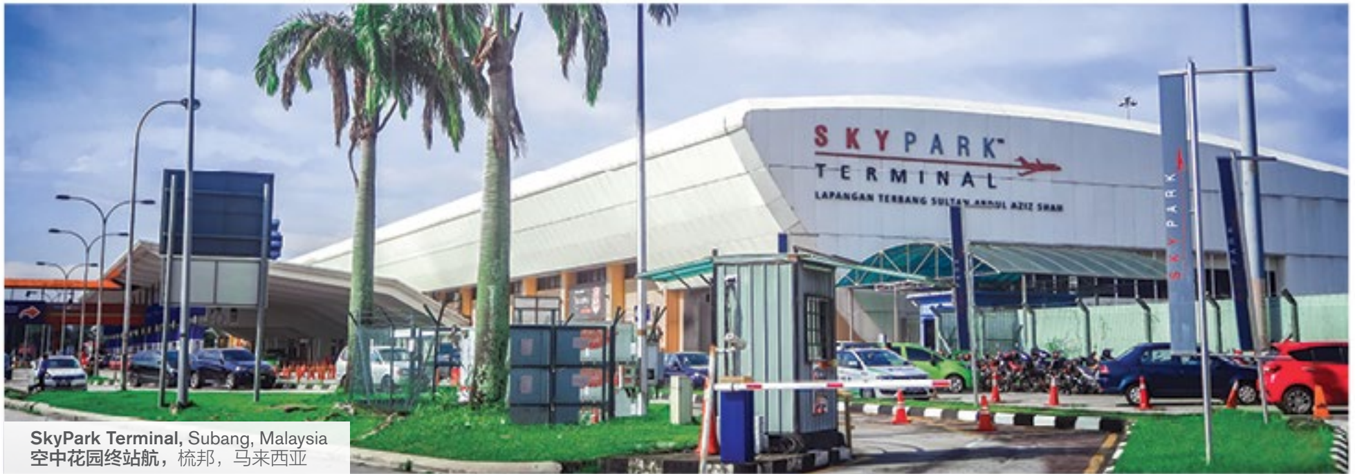
SkyPark Terminal, Subang, Malaysia 空中花园航站楼, 梳邦, 马来西亚