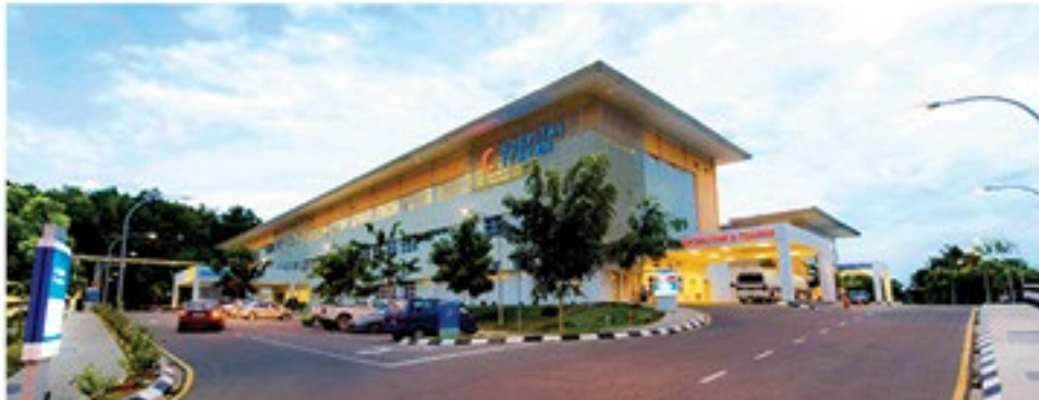
Tuaran Hospital, Sabah, Malaysia 斗亚兰医院, 沙巴, 马来西亚