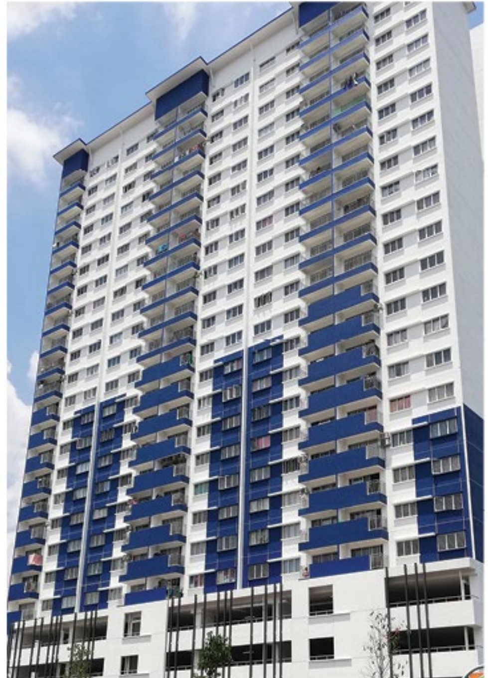
Police Quarters, Ulu Kelang, Selangor, Malaysia 警察宿舍, 淡江, 雪兰莪, 马来西亚