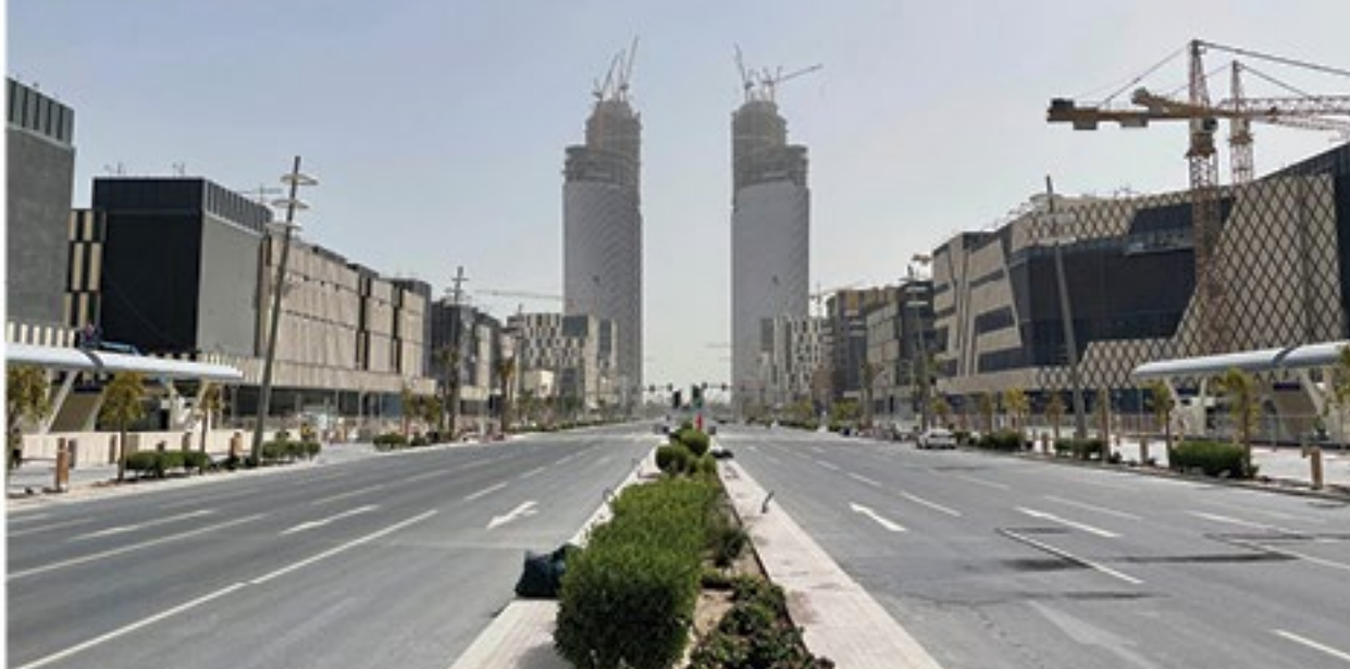
Construction of commercial boulevard with Road A4. 建造设有A4型道路的商业大道。