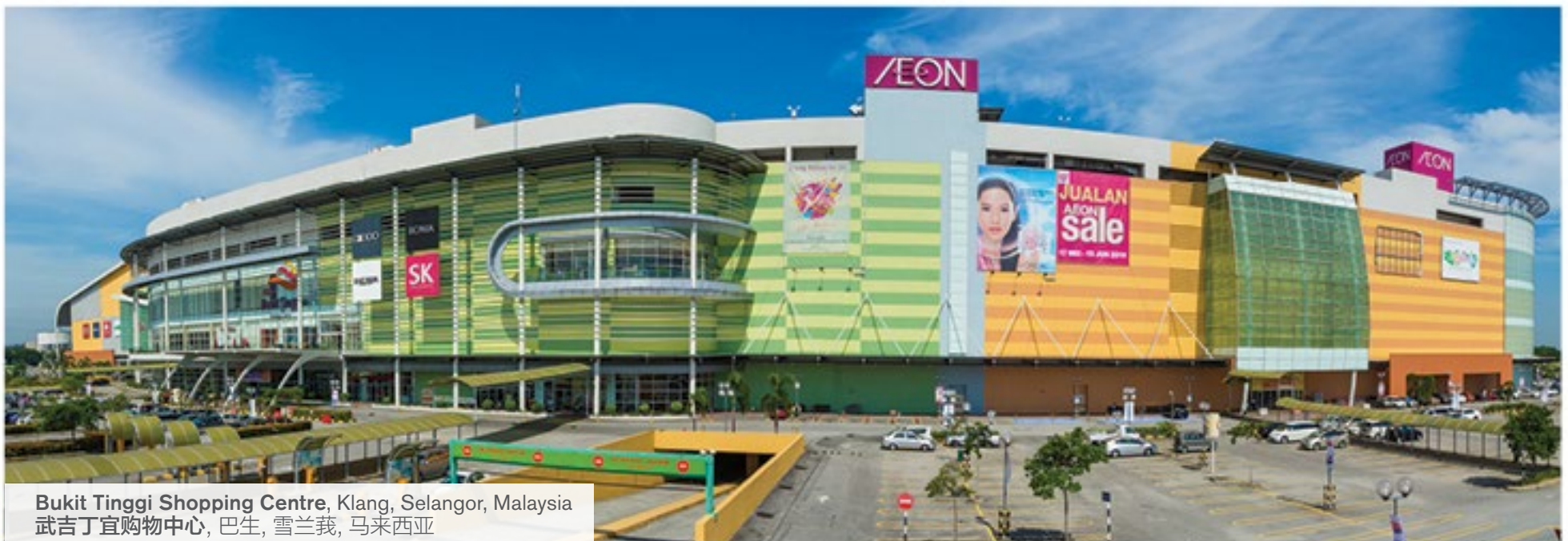
Bukit Tinggi Shopping Centre, Klang, Selangor, Malaysia 武吉丁宜购物中心, 巴生, 雪兰莪, 马来西亚