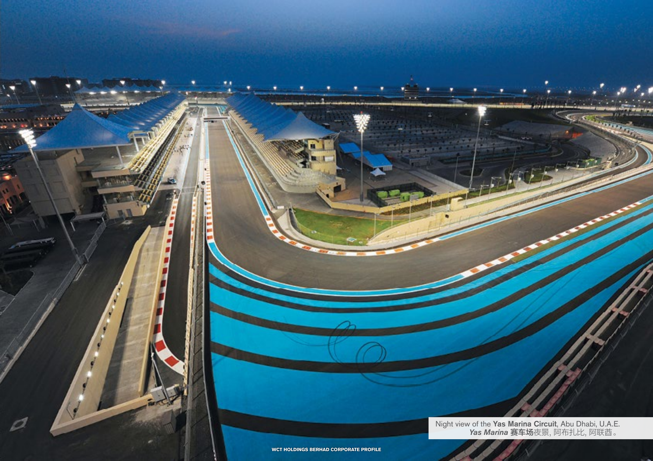
Night view of the Yas Marina Circuit , Abu Dhabi, U.A.E. Yas Marina 赛车场夜景, 阿布扎比, 阿联酋。