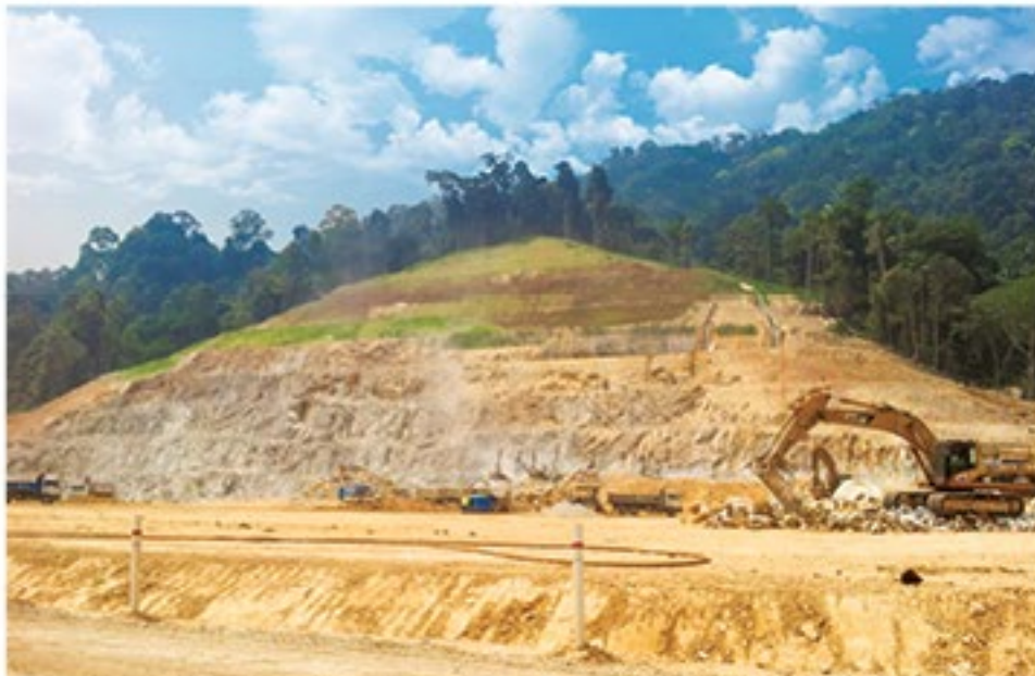
Vale of Brazil's Iron Ore Distribution Centre, Perak, Malaysia Vale of Brazil's Iron Ore 分销中心, 霹雳, 马来西亚