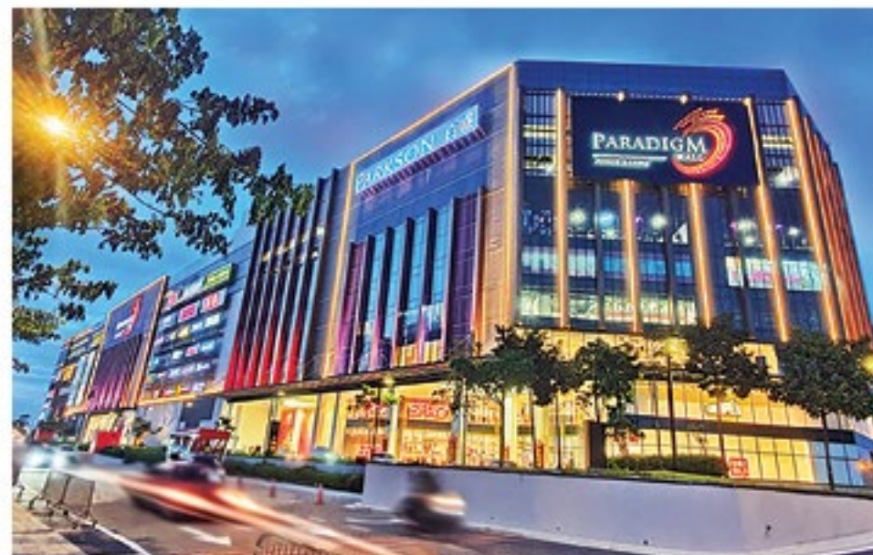
Paradigm Mall Johor Bahru , Johor, Malaysia 新山佰乐泰商场 , 柔佛, 马来西亚