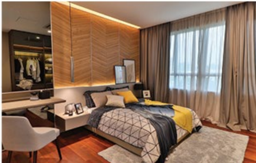
Impiria Residensi, Bandar Bukit Tinggi 2, Klang, Selangor, Malaysia Impiria Residensi, 武吉丁宜镇第二区, 巴生, 雪兰莪, 马来西亚