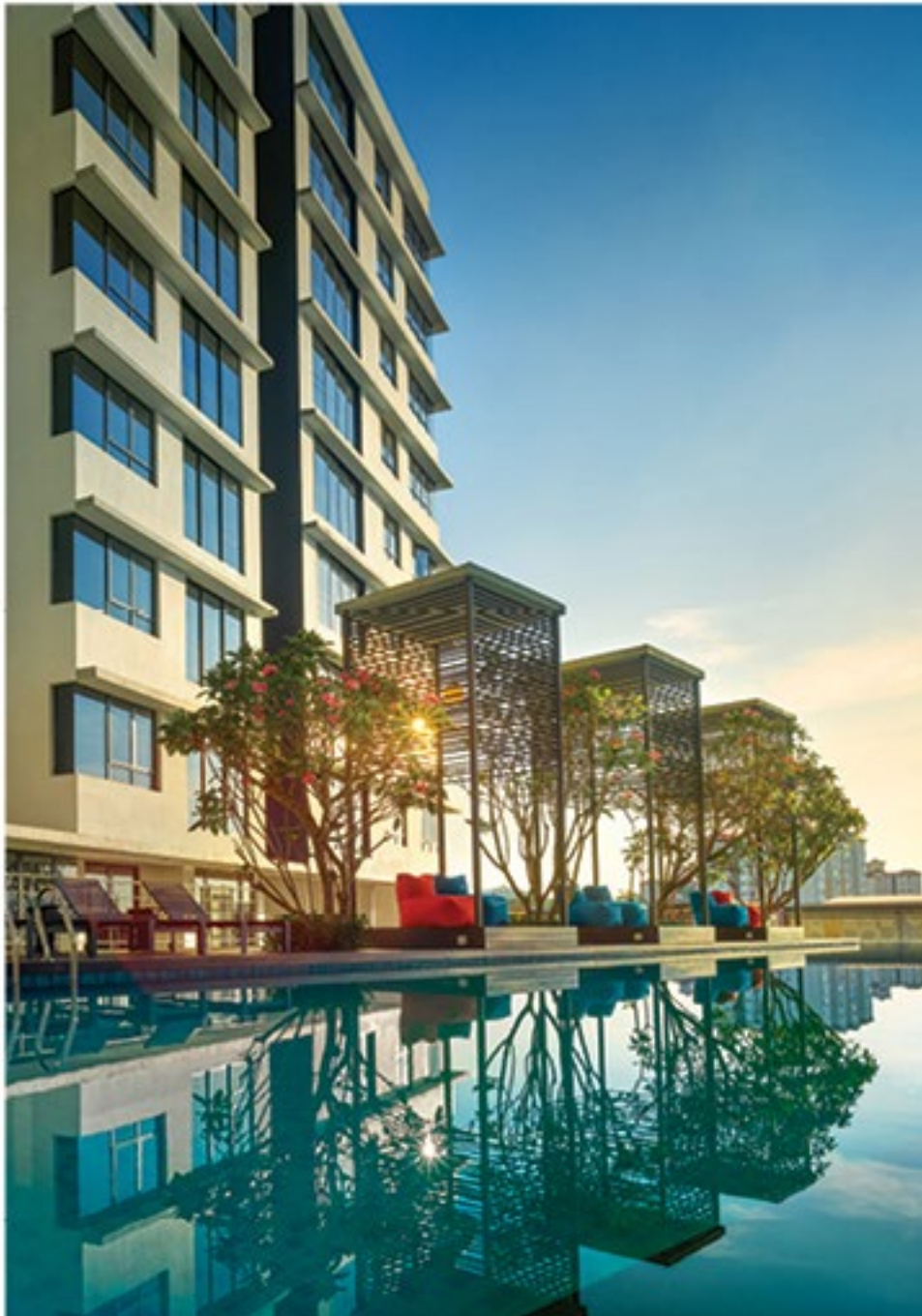
Renai Jelutong Residences , Bukit Jelutong, Shah Alam, Selangor, Malaysia Renai Jelutong Residences , 武吉日落洞, 沙亚南, 雪兰莪, 马来西亚