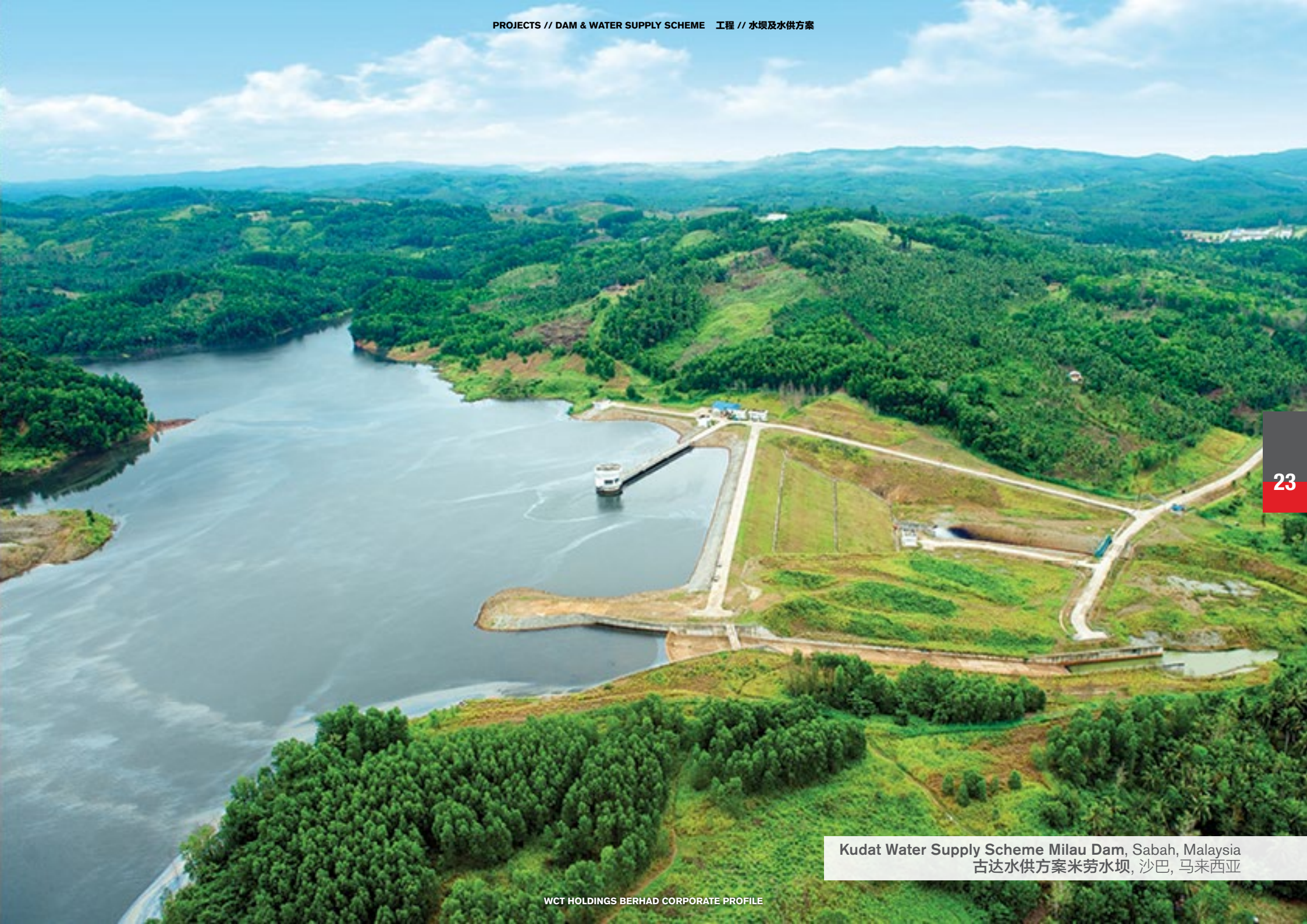
Kudat Water Supply Scheme Milau Dam, Sabah, Malaysia 古达水供方案米劳水坝, 沙巴, 马来西亚