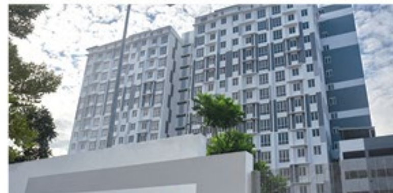
Trifolis Apartment , Bandar Bukit Tinggi 2, Klang, Selangor, Malaysia Trifolis Apartment , 武吉丁宜镇第二区, 巴生, 雪兰莪, 马来西亚

每个单位的实用面积为915平方英尺，设有三间卧室和两间浴室。每个单位亦可获得两个可直通电梯大堂的有盖停车位。该公寓还配备了一系列安全设施，包括24小时巡逻、车辆出入控制和警卫室的闭路电视系统。