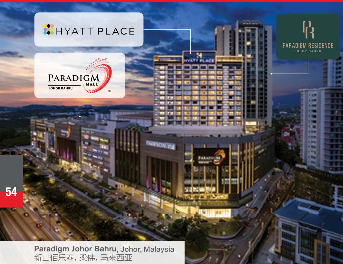
Paradigm Johor Bahru, Johor, Malaysia 新山佰乐泰, 柔佛, 马来西亚