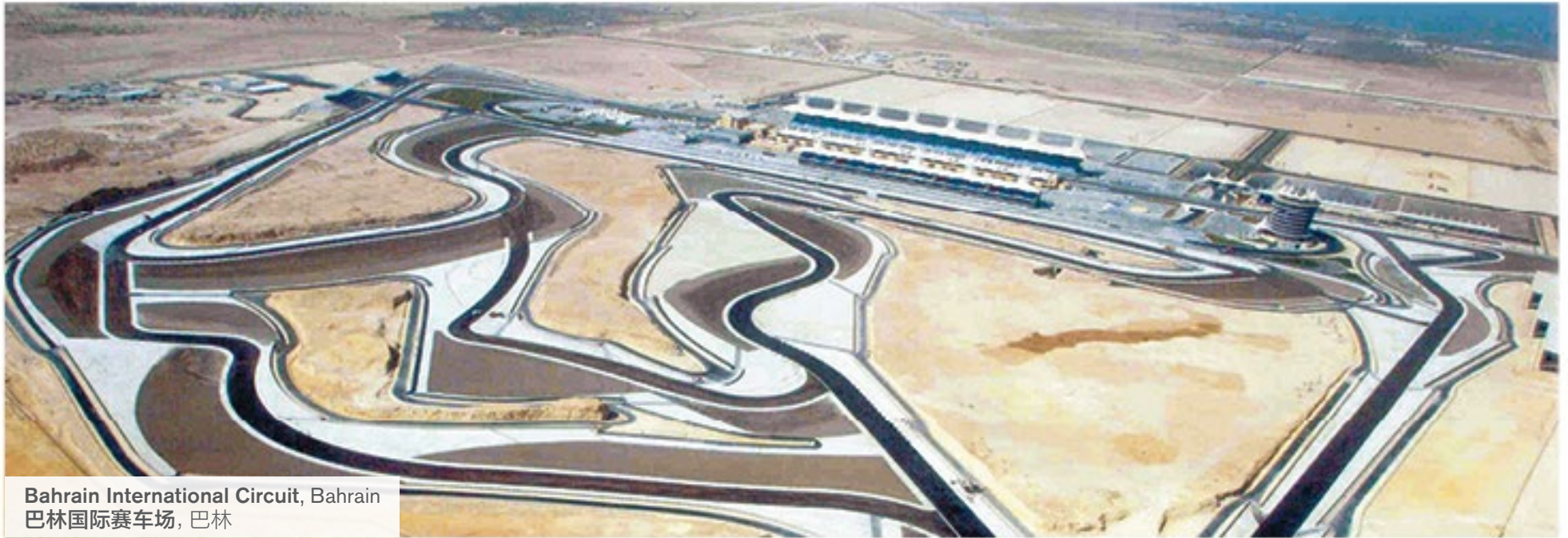
Bahrain International Circuit, Bahrain 巴林国际赛车场, 巴林